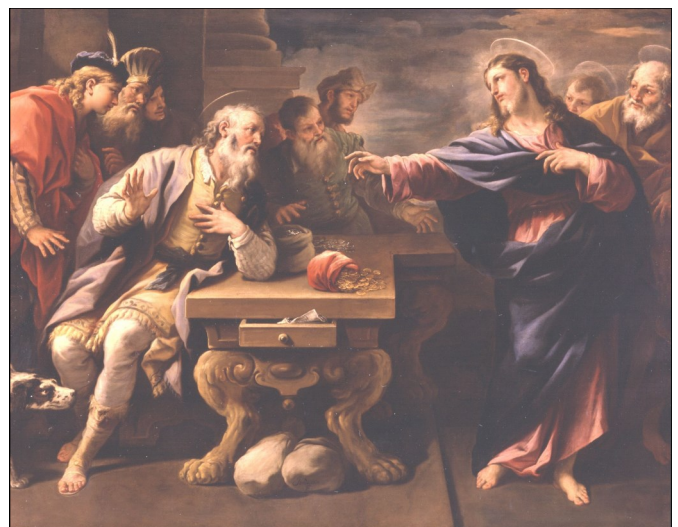
The Calling of Matthew

This tax collector is turning into certainly considered one of his ardent supporters. Jesus seeks a general alternate in place of simply ethical correction. And that is what takes place because Matthew, now no longer most effective, leaves his tax booth. However, he right away begins evolving telling his pals approximately the super news.